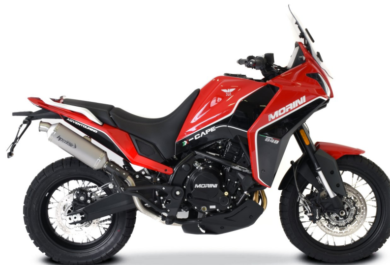
SP-1 SHORT TITANIUM SILENCER + DECATALYST Code MOXCSP1300T-AB + Code MOXCS-D